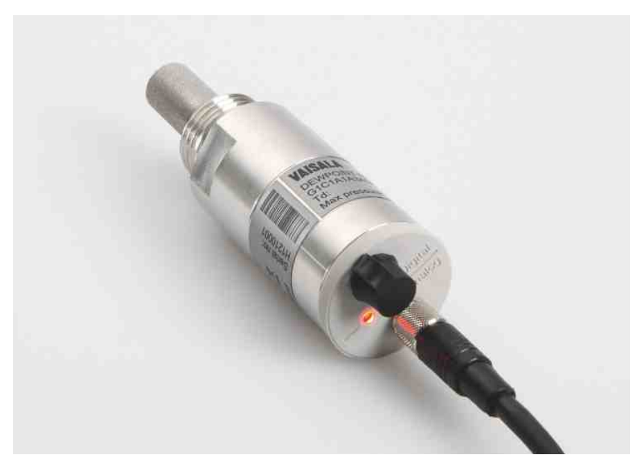
The Vaisala DRYCAP® Dewpoint Transmitter DMT143 is an ideal choice for small compressed air dryers, plastic dryers and other OEM applications.